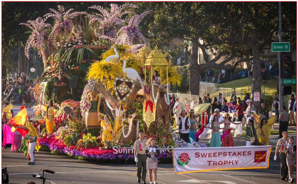
2014 Sweepstakes Trophy Winner, Dole Packaged Foods, “Sunrise at the Oasis”