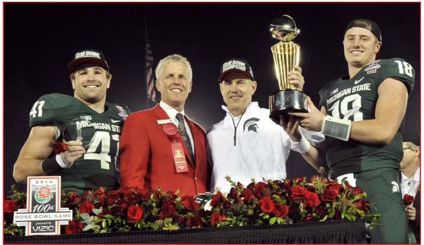
Michigan State 100th Rose Bowl Game champions

The Tournament of Roses hosted the champions of its partner conferences, the Big Ten and Pac-12: Michigan State University and Stanford University — in a historic edition of The Granddaddy of Them All®, the 100th Rose Bowl Game®.