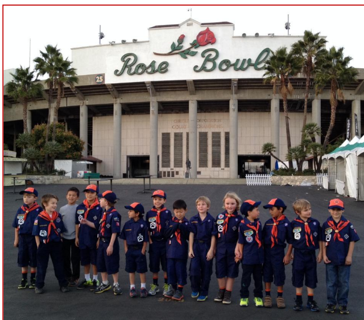
Den 2 Tiger Cub Scouts get ready to tour the Rose Bowl Stadium

The Rose Bowl Stadium is seeking volunteer docents for our tour program! If you have a passion for Pasadena, history, or sports, they’d love for you to join them.