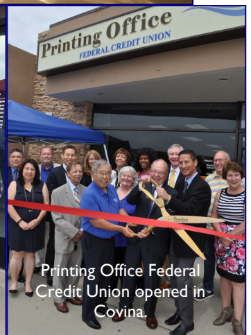
Printing Office Federal Credit Union opened in Covina.