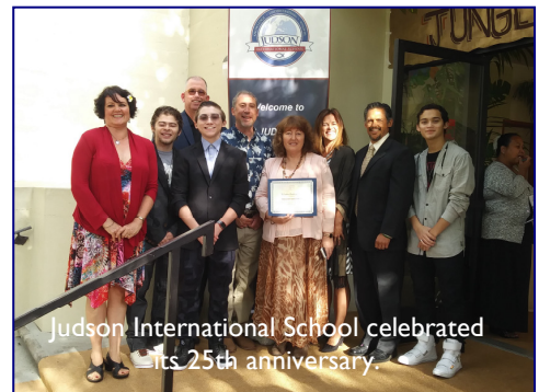
Judson International School celebrated its 25th anniversary.