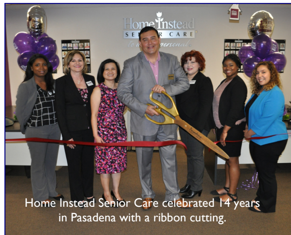
Home Instead Senior Care celebrated 14 years in Pasadena with a ribbon cutting.