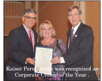
Kaiser Permanente was recognized as Corporate Citizen of the Year.