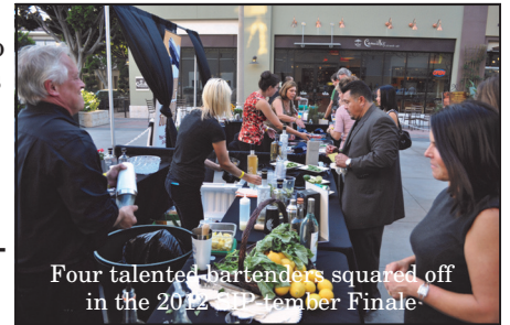
Four talented bartenders squared off in the 2012 SIP-tember Finale.

Over the course of six weeks, 64 cocktails faced off to determine which four finalists compete during the live taste-off at the Rose Bowl. Taste of Pasadena participants (so far) include Toro Sushi Bar Lounge, Kings Row Gastro-pub, Kal's Mediterranean Bisto, BJ's Restaurant and Brewhouse, Haven Gastro-