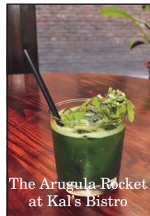
The Arugula Rocket at Kal's Bistro

Join us for the second Taste of Pasadena and SIP-tember Finale on Thursday, September 26th from 6PM to 9PM at the Rose Bowl . Enjoy food and drink tastings from many of Pasadena's finest restaurants and help decide which SIP-tember cocktail is Pasadena's favorite.