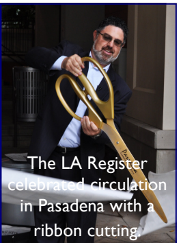
The LA Register celebrated circulation in Pasadena with a ribbon cutting.