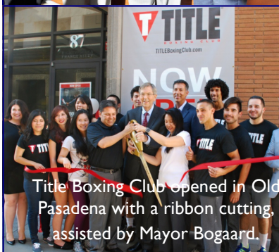
Title Boxing Club opened in Old Pasadena with a ribbon cutting, assisted by Mayor Bogaard.