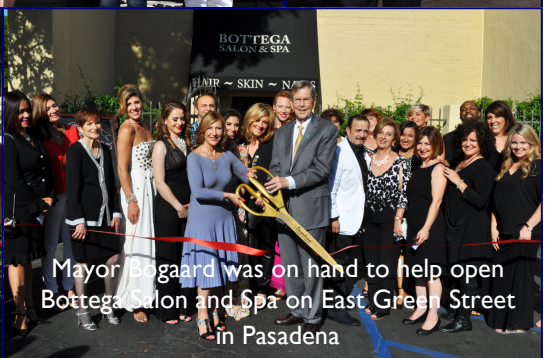
Mayor Bogaard was on hand to help open Bottega Salon and Spa on East Green Street in Pasadena.