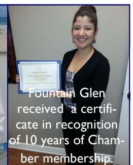
Fountain Glen received a certificate in recognition of 10 years of Chamber membership.