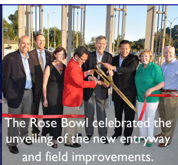
The Rose Bowl celebrated the unveiling of the new entryway and field improvements.