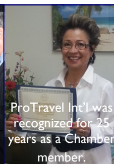
ProTravel Int'l was recognized for 25 years as a Chamber member.