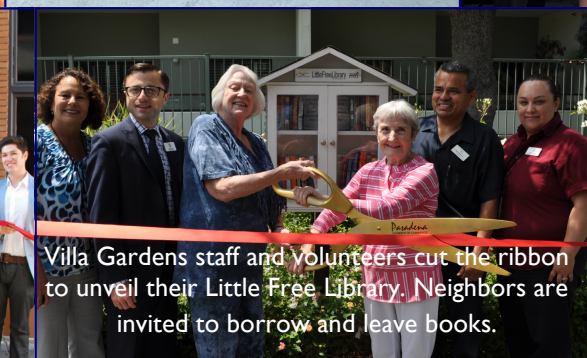
Villa Gardens staff and volunteers cut the ribbon to unveil their Little Free Library. Neighbors are invited to borrow and leave books.