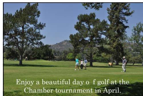
Enjoy a beautiful day of golf at the Chamber tournament in April.

As of this date, Parsons Corporation is a Silver Sponsor of the 2014 Pasadena Chamber of Commerce Golf Tournament.