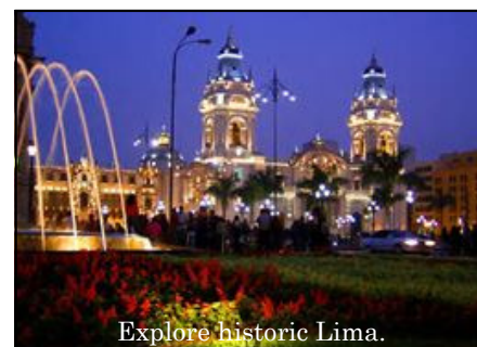
Explore historic Lima.