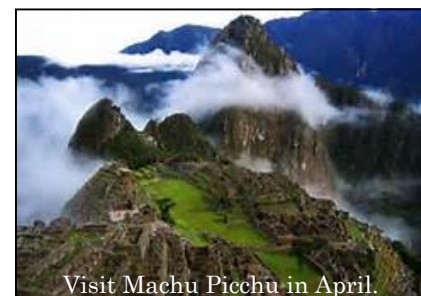
Visit Machu Picchu in April.

The trip departs on April 7th for nine days. The $3,999 price includes round-trip airfare from Los Angeles (LAX), all air and fuel surcharges, and departure taxes and fees.