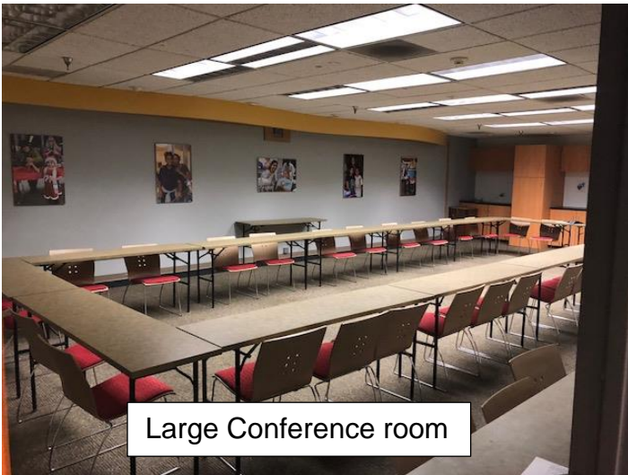
Large Conference room