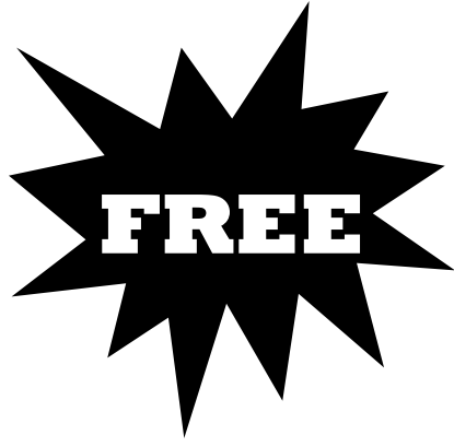
And MUCH MORE!!