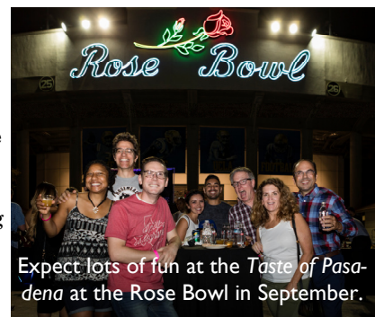
Expect lots of fun at the Taste of Pasadena at the Rose Bowl in September.

Tickets to the Taste of Pasadena are available online at www.pasadena-chamber.org and through Goldstar .