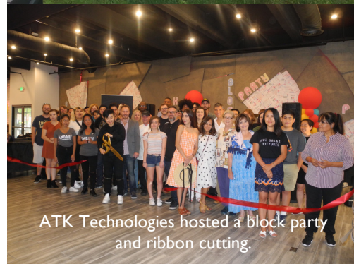
ATK Technologies hosted a block party and ribbon cutting.