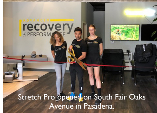
Stretch Pro opened on South Fair Oaks Avenue in Pasadena.