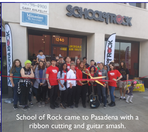
School of Rock came to Pasadena with a ribbon cutting and guitar smash.