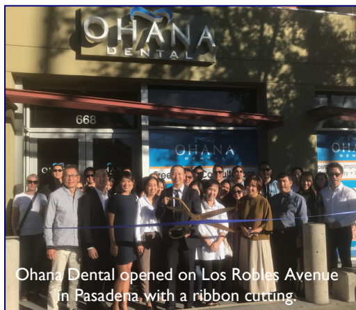
Ohana Dental opened on Los Robles Avenue in Pasadena with a ribbon cutting.