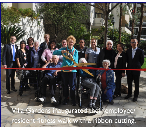
Villa Gardens inaugurated their employee/resident fitness walk with a ribbon cutting.