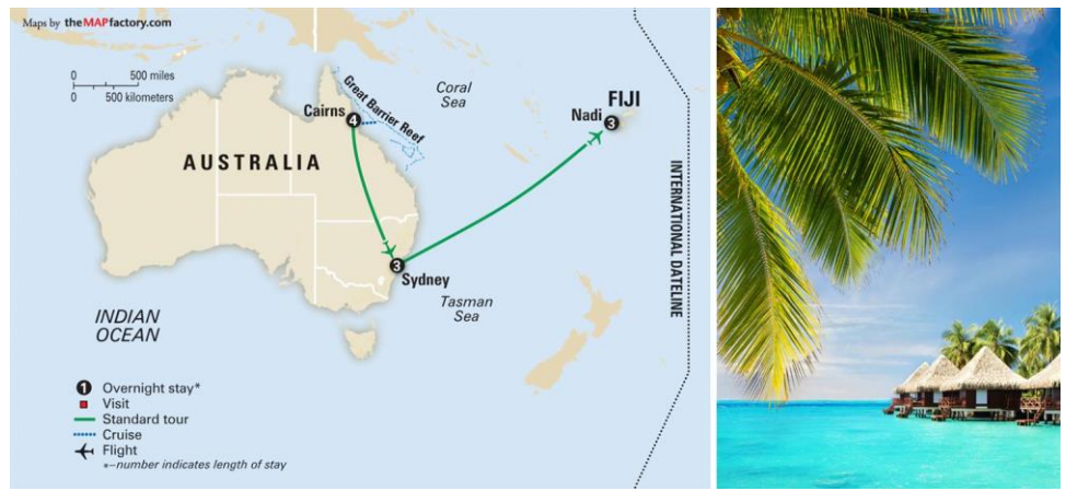
13 Days ● 16 Meals: 10 Breakfasts, 1 Lunch, 5 Dinners