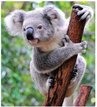
Highlights... Cairns, Great Barrier Reef, Tjapukai Aboriginal Cultural Park, Hartley's Crocodile Farm, Sydney, Sydney Opera House, Sydney Harbour Cruise, Fiji

Day 1 – 2: November 2 – 3, 2015 Overnight Flight Cross the International Dateline and begin the adventure of a lifetime by skipping a day ahead.