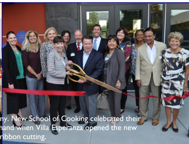
From left, Genesis Dental Esthetics opened with a ribbon-cutting ceremony. New School of Cooking celebrated their first anniversary with a ribbon-cutting ceremony. The Chamber was on hand when Villa Esperanza opened the new Villa School building with a celebration and ribbon cutting.