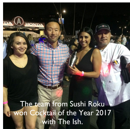
The team from Sushi Roku won Cocktail of the Year 2017 with The Ish.

Voting for SIP-tember kicks off on August 1, 2018. A complete list of venues offering cocktails for the 2018 SIP-tember Cocktail Bracket Challenge will be announced in July. Information is posted at pasadenarestaurantweek.com as it becomes available.