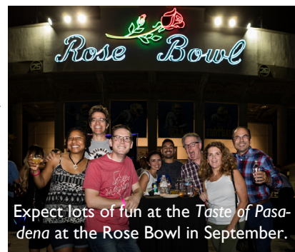
Expect lots of fun at the Taste of Pasadena at the Rose Bowl in September.

Tickets to the Taste of Pasadena are available online at www.pasadena-chamber.org and through EventBrite and Goldstar.