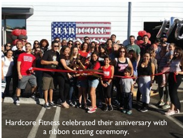
Hardcore Fitness celebrated their anniversary with a ribbon cutting ceremony.

ultraHealth Agency , Dane Flanigan, (877) 390-0992