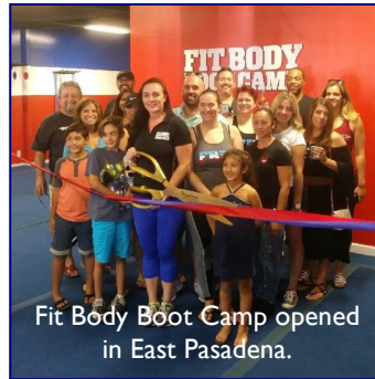
Fit Body Boot Camp opened in East Pasadena.