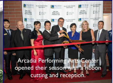
Arcadia Performing Arts Center opened their season with a ribbon cutting and reception.