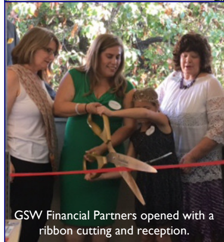
GSW Financial Partners opened with a ribbon cutting and reception.