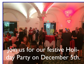
Join us for our festive Holiday Party on December 5th.