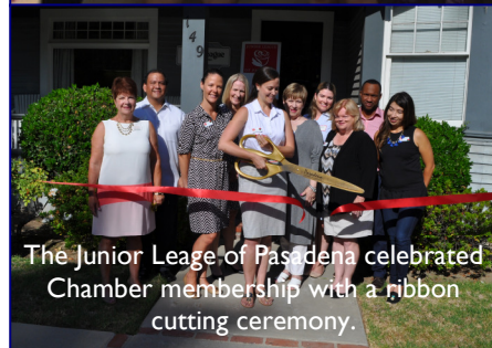
The Junior League of Pasadena celebrated Chamber membership with a ribbon cutting ceremony.