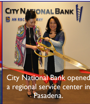
City National Bank opened a regional service center in Pasadena.