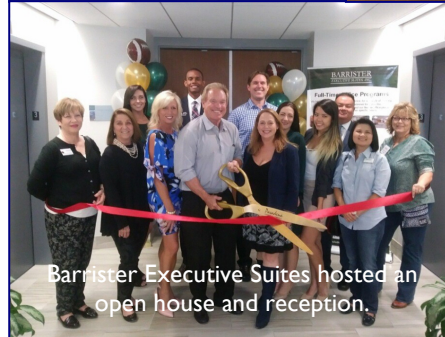
Barrister Executive Suites hosted an open house and reception.