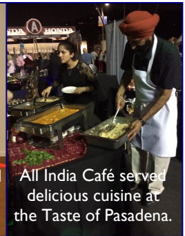
All India Café served delicious cuisine at the Taste of Pasadena.