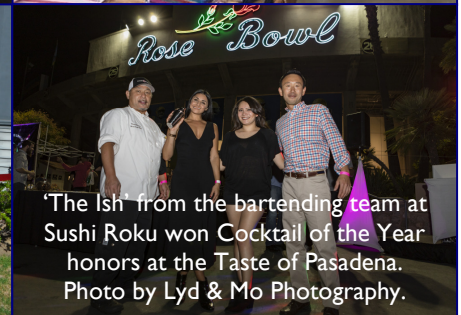
'The Ish' from the bartending team at Sushi Roku won Cocktail of the Year honors at the Taste of Pasadena.