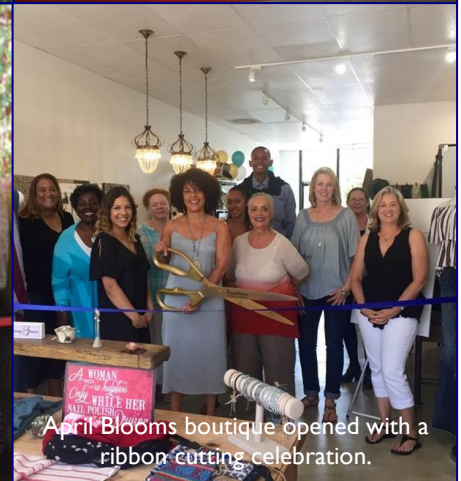
April Blooms boutique opened with a ribbon cutting celebration.