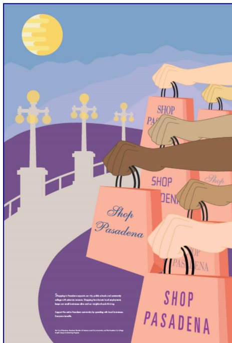
Students in the Graphic Design and Advertising Department Pasadena City College created our most recent Shop Pasadena ad campaign.

Anderson Business Technology, 100yrs. D. A. Davidson & Co., 66yrs. Fedde Furniture Co., 53yrs. Hahn & Hahn, LLP, 94yrs. Huntington Hospital, 91yrs.