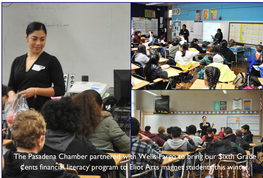
The Pasadena Chamber partnered with Wells Fargo to bring our sixth grade cents financial literacy program to Eliot Arts magnet students this winter.