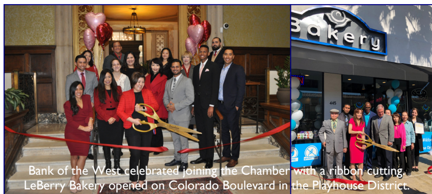
Bank of the West celebrated joining the Chamber with a ribbon cutting. LeBerry Bakery opened on Colorado Boulevard in the Playhouse District.